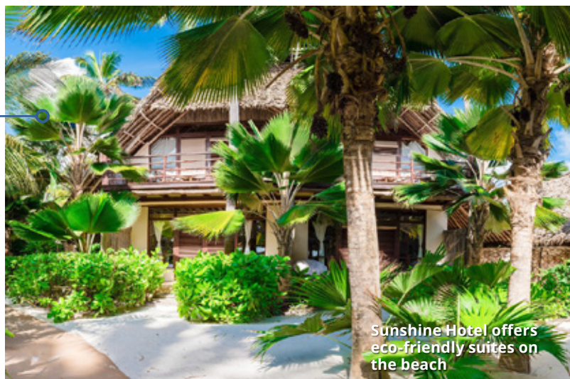
Sunshine Hotel offers eco-friendly suites on the beach

Sunshine Hotel is located on the tranquil northeast side of the island in the fishing village of Matemwe. It is about an hour's drive from Stone Town and the airport. Guests stay in eco-friendly suites on the ocean. It's the perfect place to relax, with a beautiful garden and two swimming pools. Sunshine Hotel offers a great white sand beach and many excursions within a short walk. Scuba divers and snorkelers can explore the coral reefs of Matemwe Island nearby.