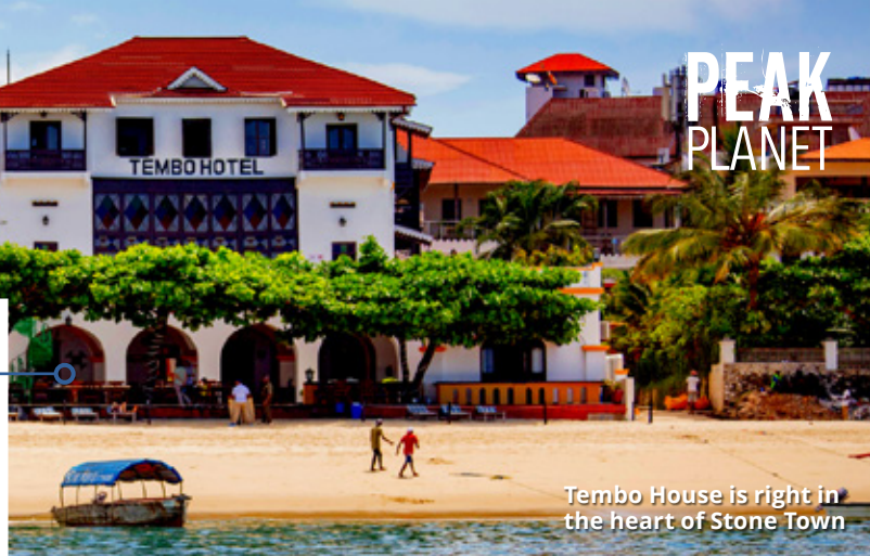
Tembo House is right in the heart of Stone Town

Tembo House is a traditional style hotel located in Stone Town along the beach. This hotel is perfect for those who want to be in the center of it all. From local cuisine restaurants and white sandy beaches, to bustling marketplaces and spice tours, all within walking distance. Due to the location of the hotel, dinner is not included with these rooms. Clients who stay here prefer to immerse themselves in the local culture and adventure out for dining.