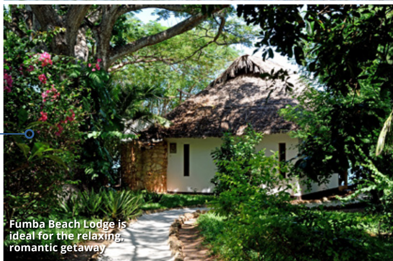
Fumba Beach Lodge is ideal for the relaxing, romantic getaway

Fumba Beach is a small, peaceful hideaway located on one of Zanzibar's most secluded beaches. The resort is situated on the Fumba Beach peninsula, part of a designated conservation area on the southwestern coast. Our guests stay in individual cottages with a stunning sea view. Just a few steps away lies a stretch of beach with sun loungers, hammocks, and umbrellas, creating a blissful spot to relax, sip a drink, and read a book on your holiday.