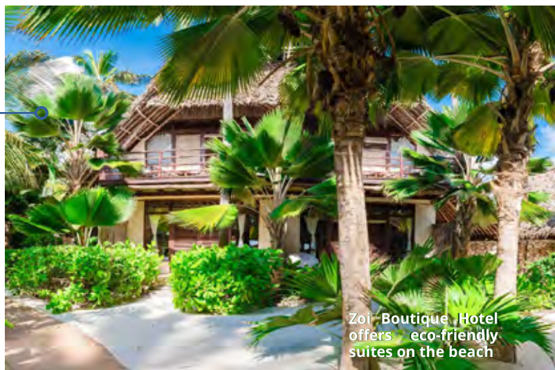
Zoi Boutique Hotel offers eco-friendly suites on the beach

Zoi Boutique Hotel is located on the tranquil northeast side of the island in the fishing village of Matemwe. It is about an hour's drive from Stone Town and the airport. Guests stay in eco-friendly suites on the ocean. It's the perfect place to relax, with a beautiful garden and two swimming pools. Zoi Boutique Hotel offers a great white sand beach and many excursions within a short walk. Scuba divers and snorkelers can explore the coral reefs of Matemwe Island nearby.