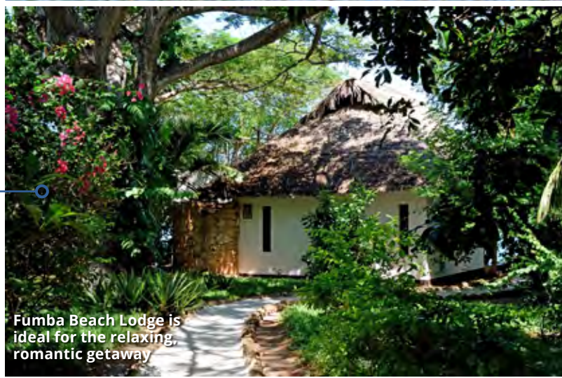
Fumba Beach Lodge is ideal for the relaxing, romantic getaway

Fumba Beach is a small, peaceful hideaway located on one of Zanzibar's most secluded beaches. The resort is situated on the Fumba Beach peninsula, part of a designated conservation area on the southwestern coast. Our guests stay in individual cottages with a stunning sea view. Just a few steps away lies a stretch of beach with sun loungers, hammocks, and umbrellas, creating a blissful spot to relax, sip a drink, and read a book on your holiday.