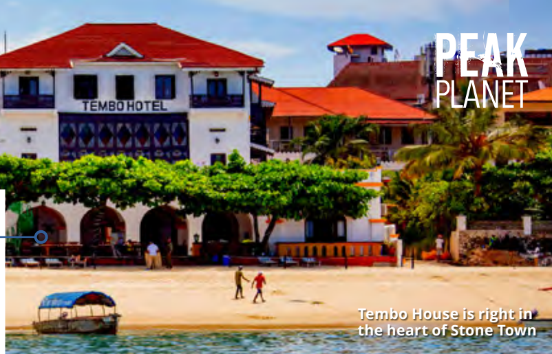
Tembo House is right in the heart of Stone Town

Tembo House is a traditional style hotel located in Stone Town along the beach. This hotel is perfect for those who want to be in the center of it all. From local cuisine restaurants and white sandy beaches, to bustling marketplaces and spice tours, all within walking distance. Due to the location of the hotel, dinner is not included with these rooms. Clients who stay here prefer to immerse themselves in the local culture and adventure out for dining.