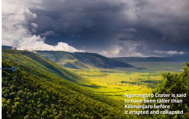
Ngorongoro Crater is said to have been taller than Kilimanjaro before it erupted and collapsed