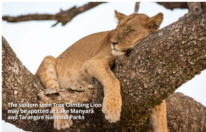
The seldom seen Tree Climbing Lion may be spotted at Lake Manyara and Tarangire National Parks