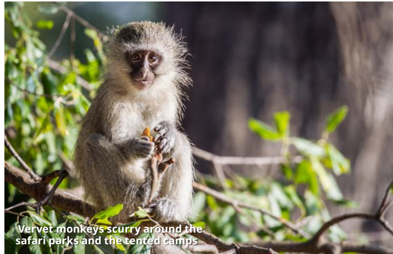
Vervet monkeys scurry around the safari parks and the tented camps