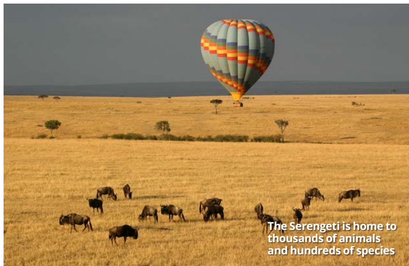
The Serengeti is home to thousands of animals and hundreds of species