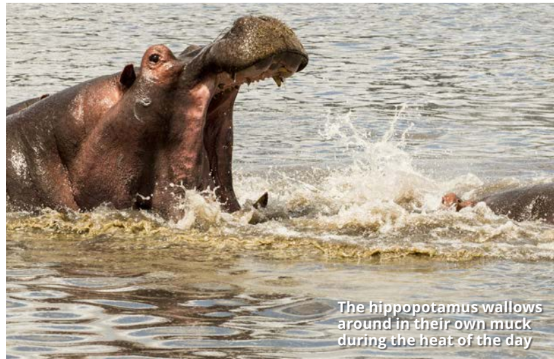
The hippopotamus wallows around in their own muck during the heat of the day