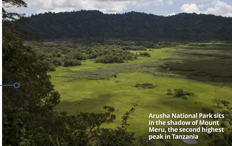
Arusha National Park sits in the shadow of Mount Meru, the second highest peak in Tanzania

Lake Manyara is a scenic gem, with some of the most spectacular views in all of Africa. Ernest Hemingway stated that its landscape was “the loveliest I had seen in Africa”. The compact game-viewing circuit through Manyara offers a virtual microcosm of the Tanzanian safari experience.