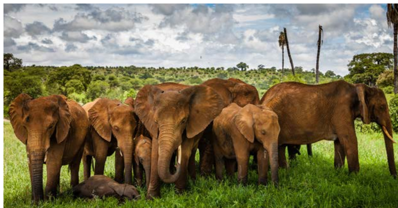
Large herds of Elephant can be seen at most of the safari parks, but are the largest in Tarangire