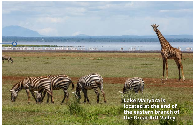
Lake Manyara is located at the end of the eastern branch of the Great Rift Valley