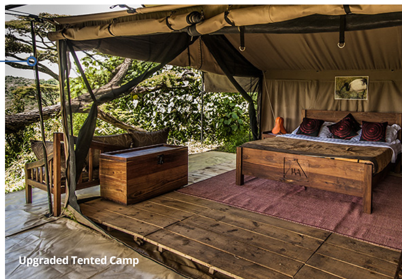
Upgraded Tented Camp