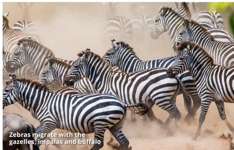
Zebras migrate with the gazelles, impalas and buffalo