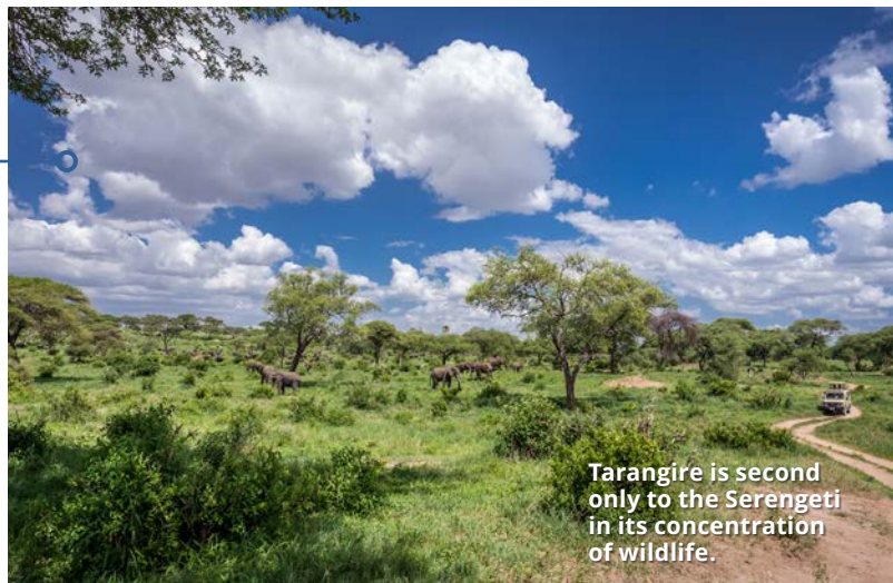
Tarangire is second only to the Serengeti in its concentration of wildlife.