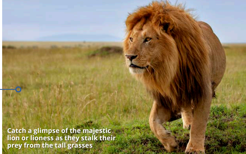
Catch a glimpse of the majestic lion or lioness as they stalk their prey from the tall grasses