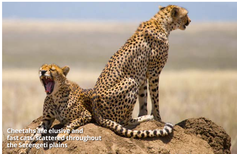
Cheetahs are elusive and fast cats scattered throughout the Serengeti plains