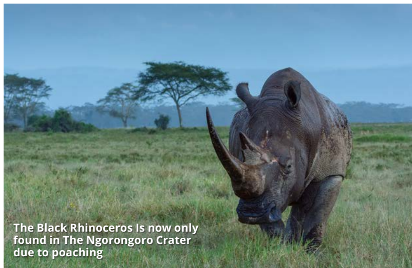
The Black Rhinoceros is now only found in The Ngorongoro Crater due to poaching