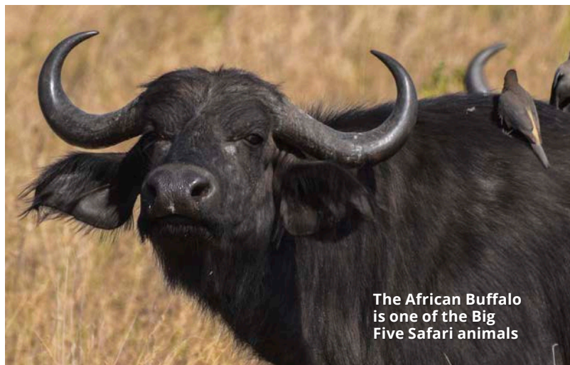
The African Buffalo is one of the Big Five Safari animals