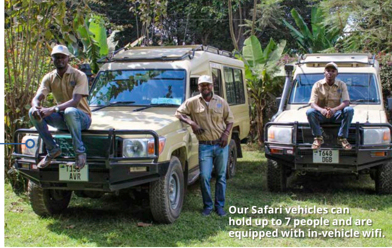
Our Safari vehicles can hold up to 7 people and are equipped with in-vehicle wifi.