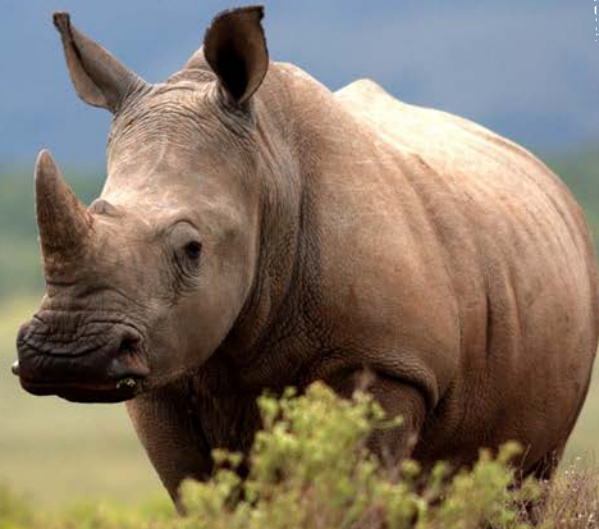
LAKE MANYARA NGORONGORO CRATER